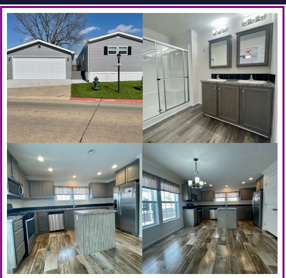
307 Mitchell St. SW

Bottom track, inside top rail, outside rail, or top rail $11.50 each